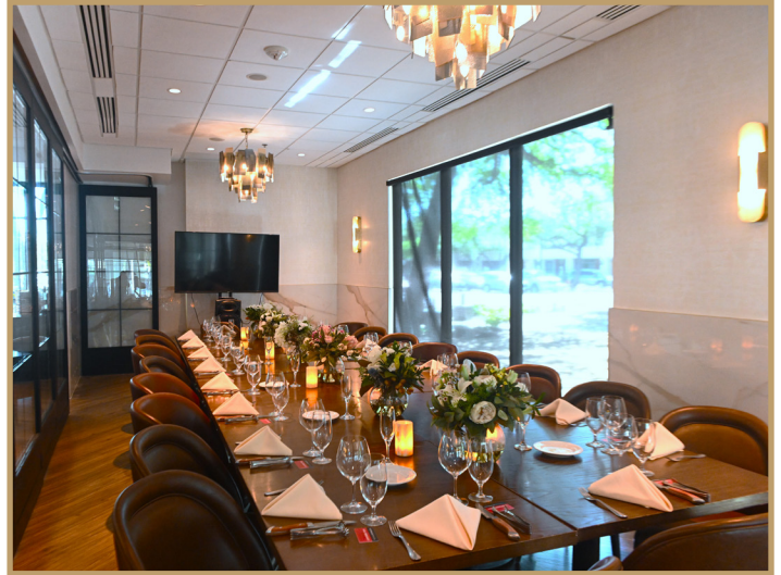
Austin Room | 20-40 Guests