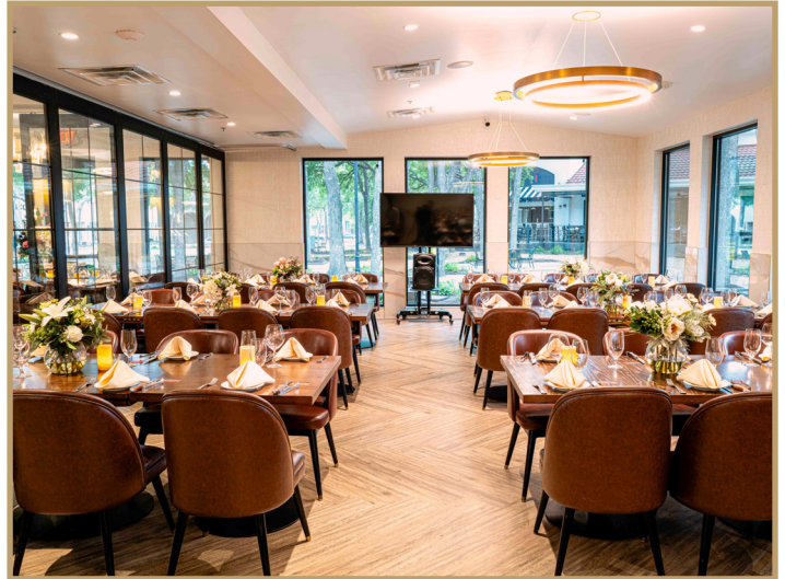
Arboretum Room | 50-60 Guests

Arboretum, Gaucho, and Estancia Room combined can accommodate up to 120 guests. Full restaurant buyout can accommodate up to 250 guests.