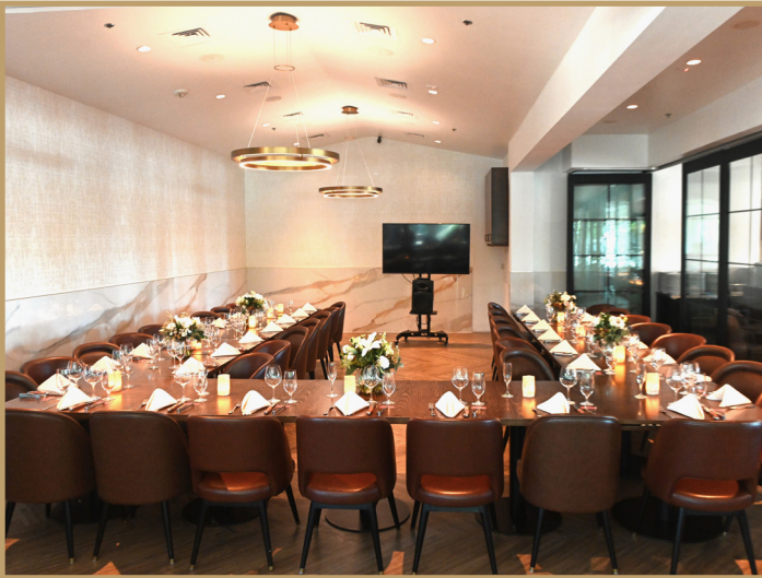
Gaucho Room | 40-50 Guests