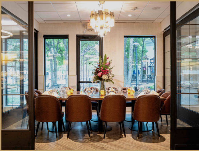
Estância Room | 12 Guests

4 Private Rooms | Full Restaurant Buyout | 100% Customizable